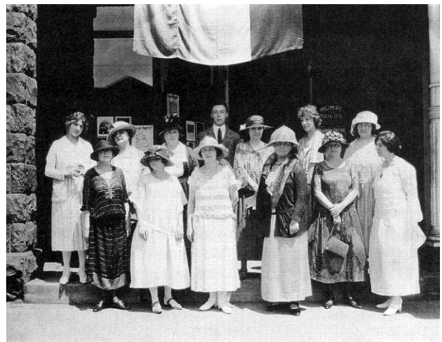
Seneca Falls, NY, July 1923 Clare at far left in second row right behind Alice Paul; Alva Vanderbilt Belmont third from right in front row

Charmed by Clare and having lost her young assistant Inez Mulholland, the dynamic suffrage leader recruited Clare into the woman’s rights movement. Clare was invited to the Belmont estate Beacon Towers in Sands Point, Long Island, and, later to