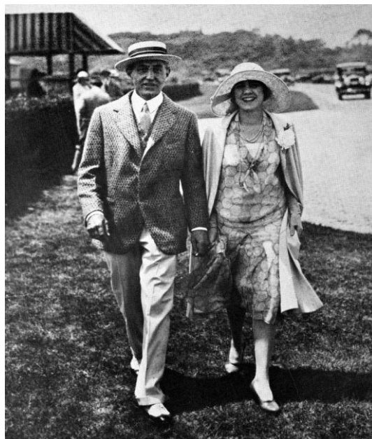
The Brokaws during happier days

As she changed hats from her role as magazine editor to author, Clare and Bernard Baruch became close and devoted friends or, as some might say, the next man entered her life. He and Clare were both intimately involved in FDR's "New Deal" at the highest level. Baruch, a successful speculator and financier, had created a persona of statesman and advisor in much the way Clare invented and reinvented herself. Sitting on a park bench in Lafayette Park across from the White House offering intellectual advice to presidents, Baruch became a character listened to by most, understood by some, and acknowledged positively by both the political world and society. Since he would not divorce his wife, who was mentally ill, his relationship with Clare seemed hopeless. Hopeless it was not and their close relationship continued until his death in 1965. Baruch's estate Hobcaw Barony in South Carolina