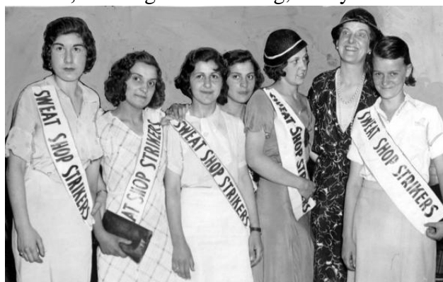
First Lady Cornelia Bryce Pinchot with the Sweat Shop Strikers, 1933

The Pinchots became widely known and appreciated across the Commonwealth through their consistent social activism. Again, Gifford ran for office but this time for the office of Governor of Pennsylvania and this time as a Republican. Pinchot challenged the strong Pennsylvania Republican “machine” in a primary that the former Progressive, not the choice of the “machine,” was supposed to lose. He did not lose; they did not lose. With Gifford’s election to the governorship in 1922, Cornelia, whom he repeatedly credited for delivering the women’s vote, hit the ground running, always with knitting in hand, and worked ceaselessly for the legal and economic rights of women in the home and in the workplace. She worked in opposition to the attempt to repeal Pennsylvania’s direct primary, which she maintained gave women a role in selecting party candidates. In Gifford’s second term as governor Cornelia turned her attention to the plight of women and children in the labor force, working