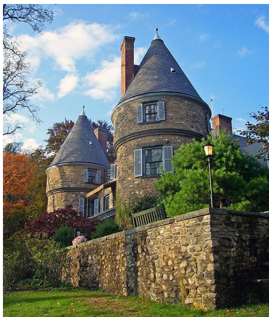
Pinchot family home, Grey Towers, Milford, Pennsylvania