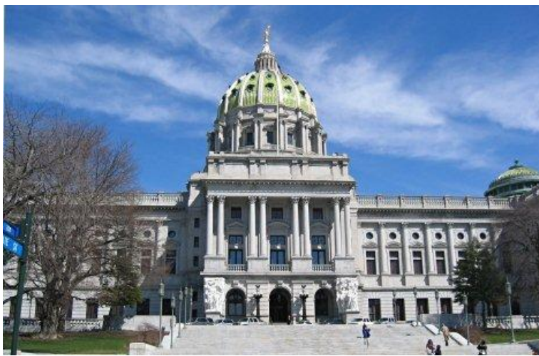
The State Capitol Building, Harrisburg, Pennsylvania, around which the activist First Lady led marches for the causes she championed while the governor, her husband, sat inside in his office

exercise their newly-won franchise, and into the unions to help institute change, but she also brought the wrath of the Roman Catholic Church down upon herself when she advocated birth control so all women, as she voiced it, could have the freedom to experience life as do men. In a speech delivered in Philadelphia in 1924, she quipped, “For thousands of years, the world has belonged to the men. They’ve had all the fun, all the excitement, all the real romance.” 20 Her devotion to women’s rights and social feminism was never compromised. When the 1938 Equal Rights Amendment was proposed, she stood in strong opposition to it because she viewed the amendment’s wording as a threat to the labor reforms already won by women. What she determined was necessary was legislation that would protect women in the workplace. 21