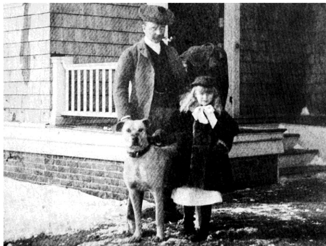
Elliott and daughter Anna Eleanor Roosevelt at Half Way Nirvana

By the spring of 1889 Elliott and Anna had completed the furnishing and decoration of Half Way Nirvana and were able to fully participate in the season's activities. Parties at their estate centered on alcohol consumption and discussions of fashions, horses, polo, and riding-to-the-hounds. Elliott's brother Theodore rarely visited Half Way Nirvana blaming Anna for Elliott's aimless lifestyle and increasing dependence upon alcohol. 17 It was during this time that Elliott and his family began moving with the seasons from Manhattan to Long Island