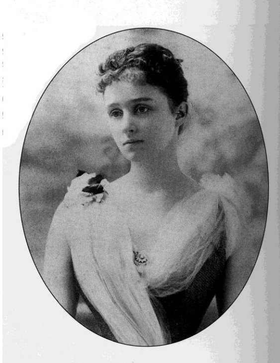
Anna Rebecca Livingston Hall Roosevelt

With the marriage of the eldest of the Hall sisters Anna Rebecca Livingston Hall to Elliott Roosevelt, Sr., who at the time of their marriage in 1883 was already known as a heavy drinker with an addiction to Laudanum, a tragic scene was set. 11