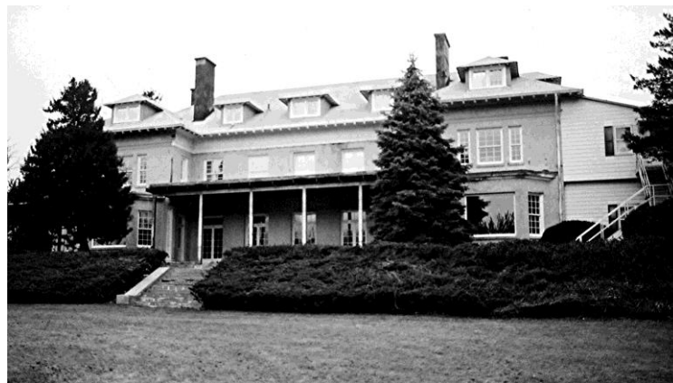
the second Jones Manor, rear facade, 2004