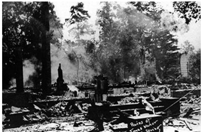
Jones Manor fire, 1909