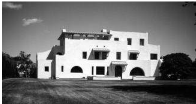
front facade, 2006