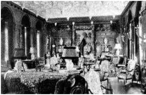
living room, c. 1903