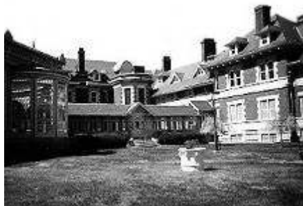
Idlehour, 1900 house, 1990

With the destruction of the first Idlehour by fire, William Kissam Vanderbilt, Sr. built a second house on the site which he also called Idlehour .