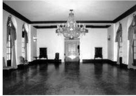
living room, 1990