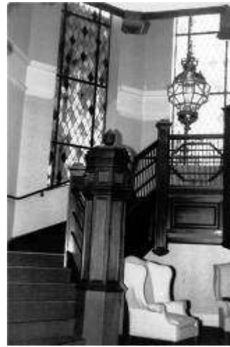
main staircase, 1990