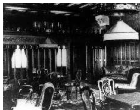
men's smoking lounge, c. 1903