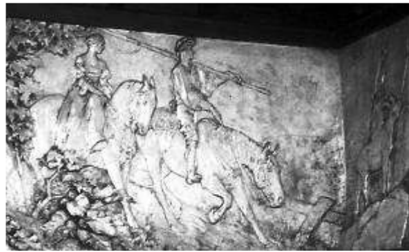
section of friezes in Hunt Room (dining room)