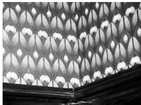
wallpaper replacement of Hunt Room friezes, 1990