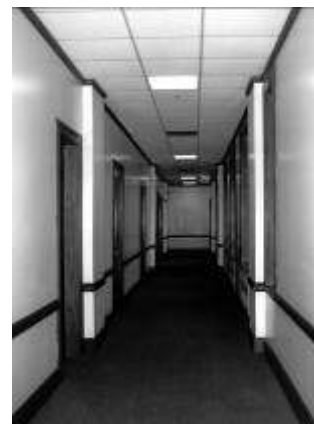
hallway outside men's smoking lounge, 1990