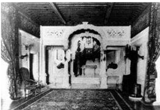
front entrance foyer and main staircase, c. 1903