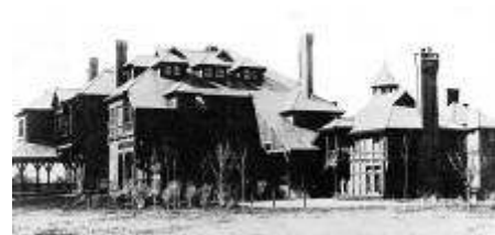
Idlehour, c. 1895

Landscape architect(s): House extant: no; 1878 house destroyed by fire in 1899***** Historical notes: