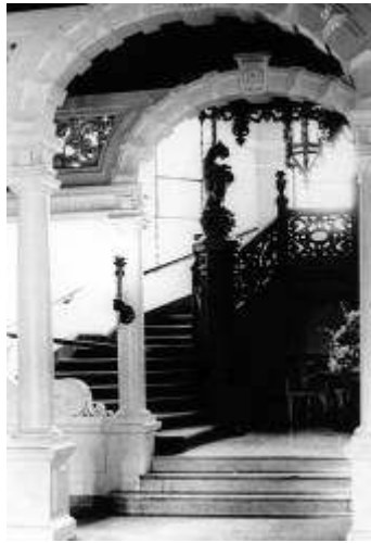
main staircase, c. 1903